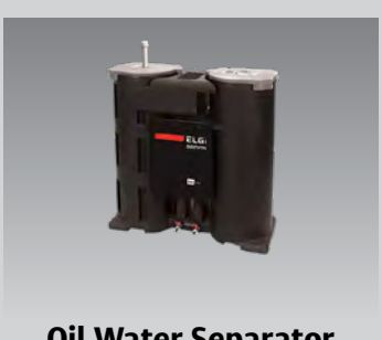
Oil Water Separator