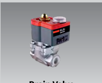
Drain Valve (Timer controlled and zero loss)