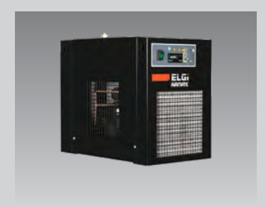
Compressed Air Dryer